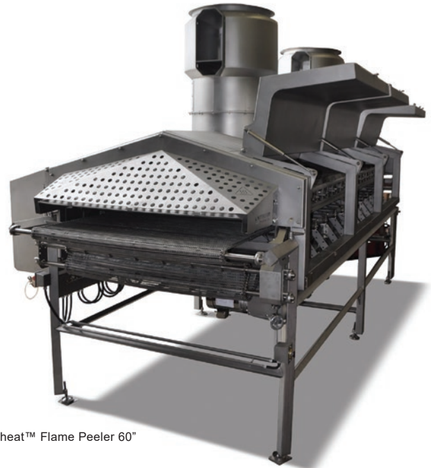
Afoheat™ Flame Peeler 60"

This patented process for flame peeling onions provides a 5 log reduction in Listeria innocua . Rather than using traditional methods of "top" and "tailing" onions, this method uses flame to burn off the outer thin layers without damaging the meaty layers, resulting in approximately 3% yield loss. The result, a surface pasteurized product with minimal yield loss.