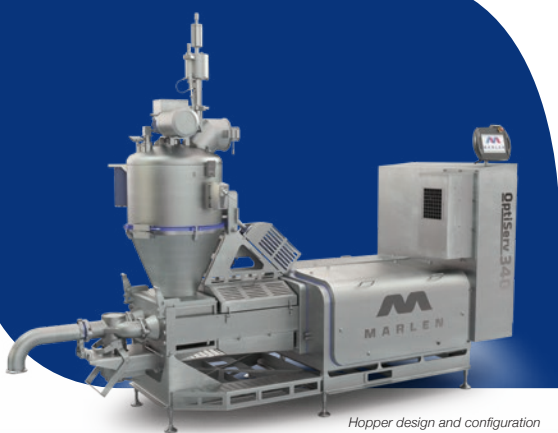
Hopper design and configuration based on application.